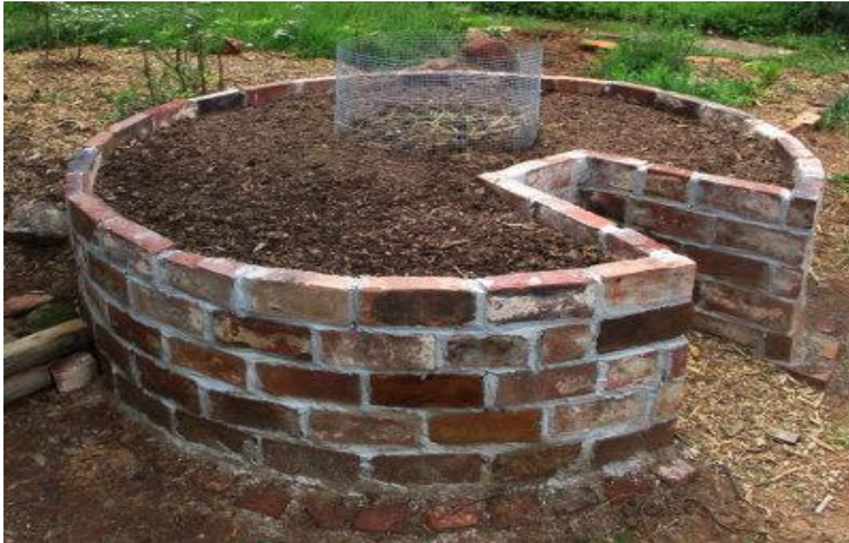
View of Keyhole Garden